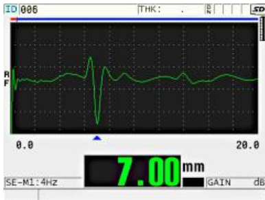
Typical conveyor belt measurement with M1036

Procedure: In the most common situation, using the M1036 transducer to measure the outer rubber layers on belts with textile or fabric reinforcement, start with the gage's M1036 default setup and increase maximum gain as necessary to measure the thickness range of interest. If necessary for measurement of thin belts, increase initial gain as well. In any of these setups, gain may usually be increased up to the point where the gage displays a constant false reading when the transducer is uncoupled, which indicates that gain is too high.